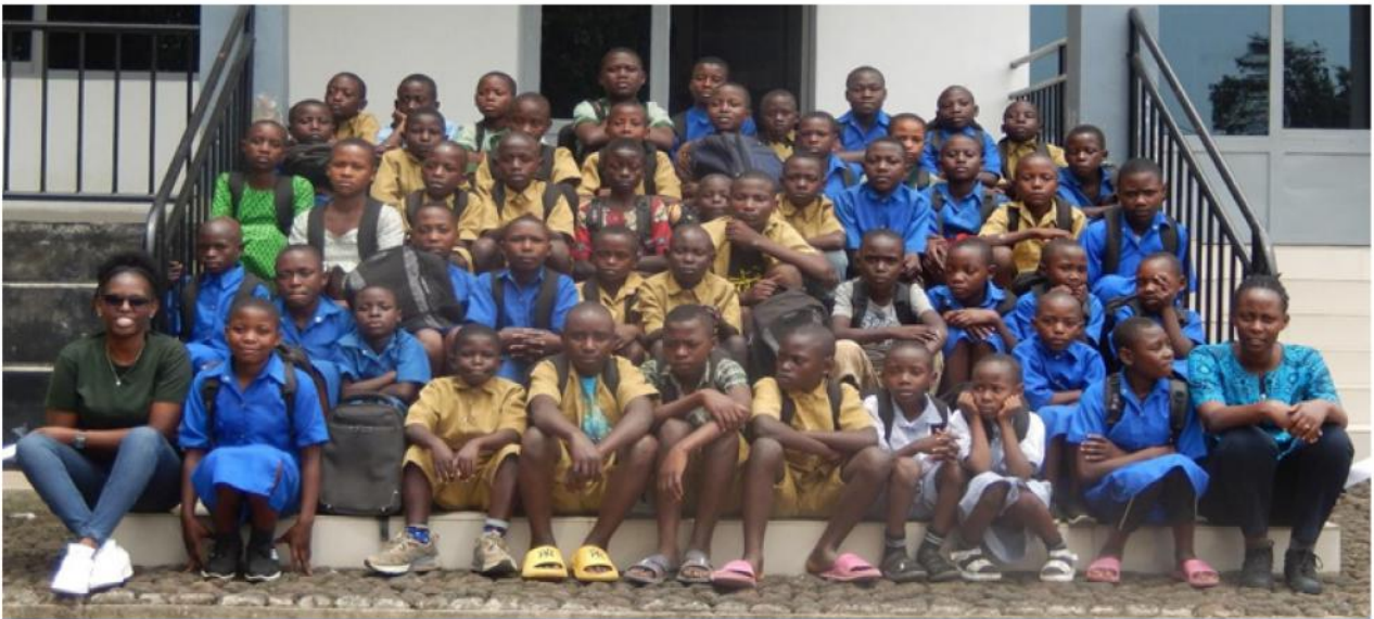
In August 2023, additional students from Musanze and Rubavu were enrolled in the CSR program

Such ongoing initiatives demonstrate EPCA's steadfast dedication to a holistic community socio-economic empowerment.