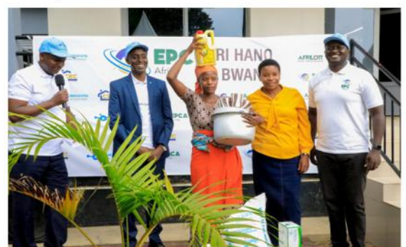
The Message from EPCA to Nyundo residents who received essential supplies was "We are here for You".